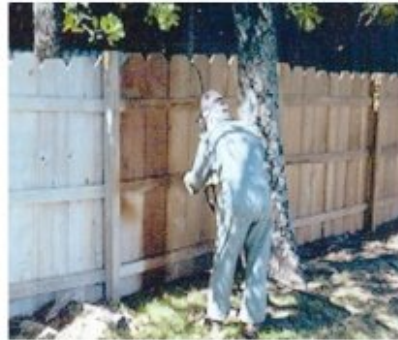
Applying TWP 100 Series Cedertone Natural to a cleaned, weathered cedar fence.

ebooks | Download PDF | *ePub | DOC | audiobook